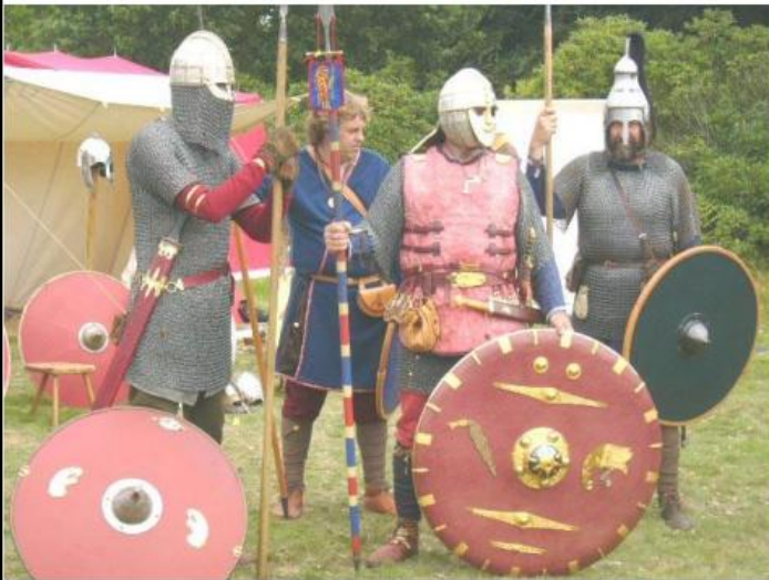
DRESSING AS SAXON WARRIORS

This is a group of Saxon Warriors. These were incredibly rich men.