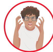
Out of Control